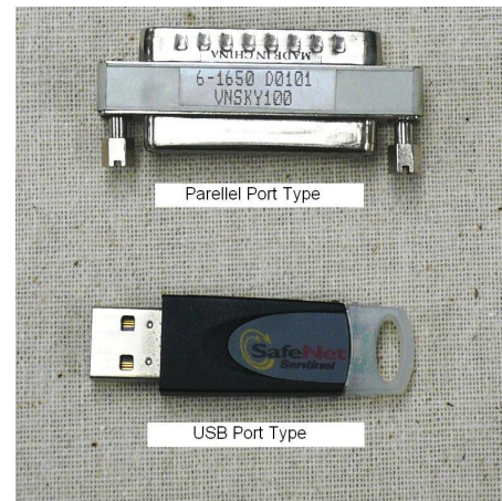
Fig.2 Security Key